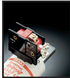
AOS-S Mounted on fuse